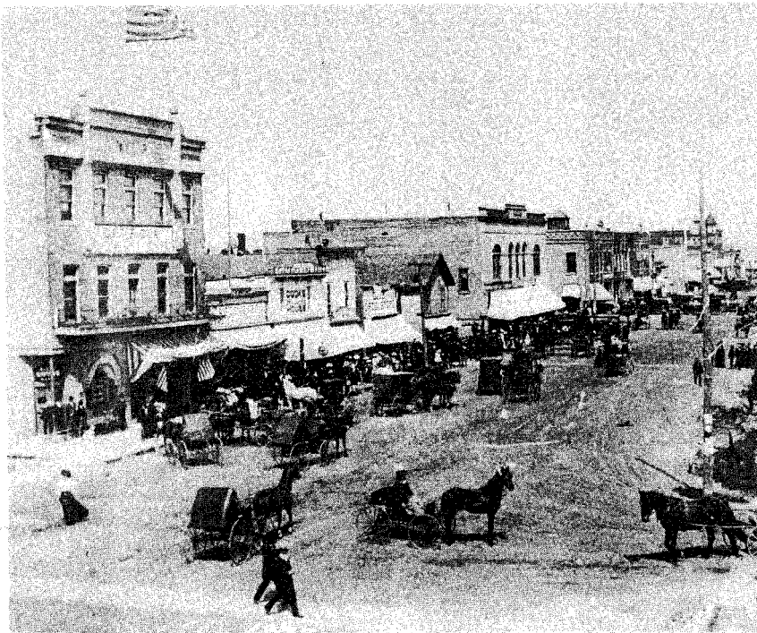
GAYLORD'S thriving Main Street in the early 1900's.

The newest club is the Jaycees founded in 1974. The club is one of the most active in the community.