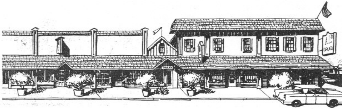
300 block of West Main Street, 1963.