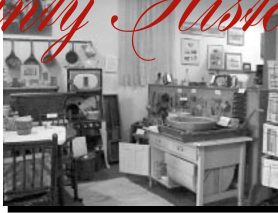
A large collection of local artifacts are displayed in the Museum, a building built in 1911 as a cigar factory. The building has the original tin ceiling. The cigar assembly table, desk, safe and other items from the cigar factory are on display.

Patron sponsorships, donations and membership dues provide the funds to maintain the Museum and to provide educational programs.