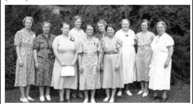
Otsego County MAEH members attending College Week at MSU in 1938

To reflect it broader mission, MAEH changed its name to Family and Community Education (FCE) in the 1990s.