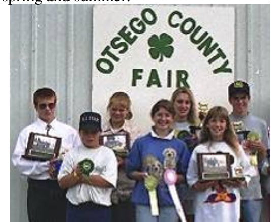
Some of the 4-H livestock winners at the 1994 Otsego County Fair

The Otsego County Fair served a similar purpose for 4-H projects conducted in the spring and summer.