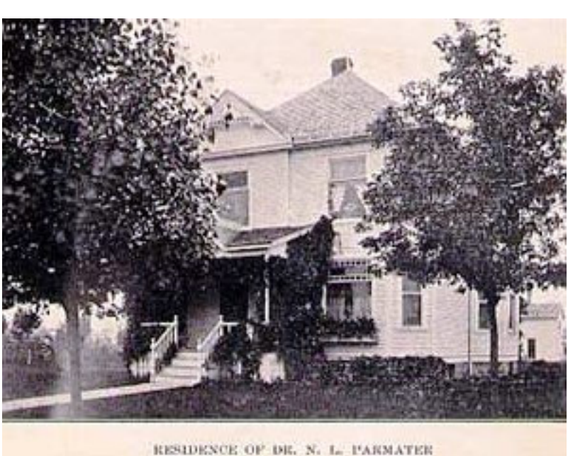
OTSEGO COUNTY HERALD Gaylord of Today - Souvenir Edition September 15, 1905