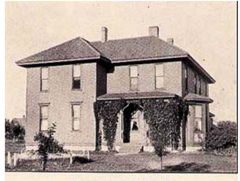
RESIDENCE OF JAMES HAZARD

OTSEGO COUNTY HERALD Gaylord of Today - Souvenir Edition September 15, 1905