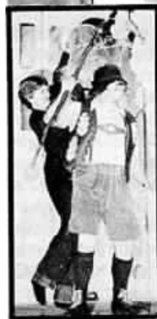
Herr Gessler has fired blanks, been doused with water, and generally tried to wreck Alpenfest.

He now tries to ruin Alpenfest for everyone by demanding quiet and that passersby bow down to his hat.