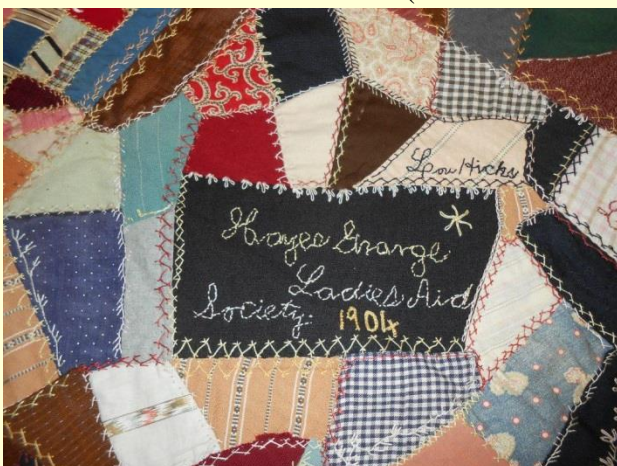
The Hayes Grange quilt is now on display at our Museum. More details soon on our web site.

Share – One of the coolest (or should it be warmest?) and very generous gifts!