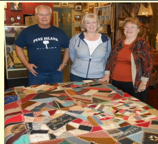
Share your knowledge of the Granges and the important role they played in Otsego County.