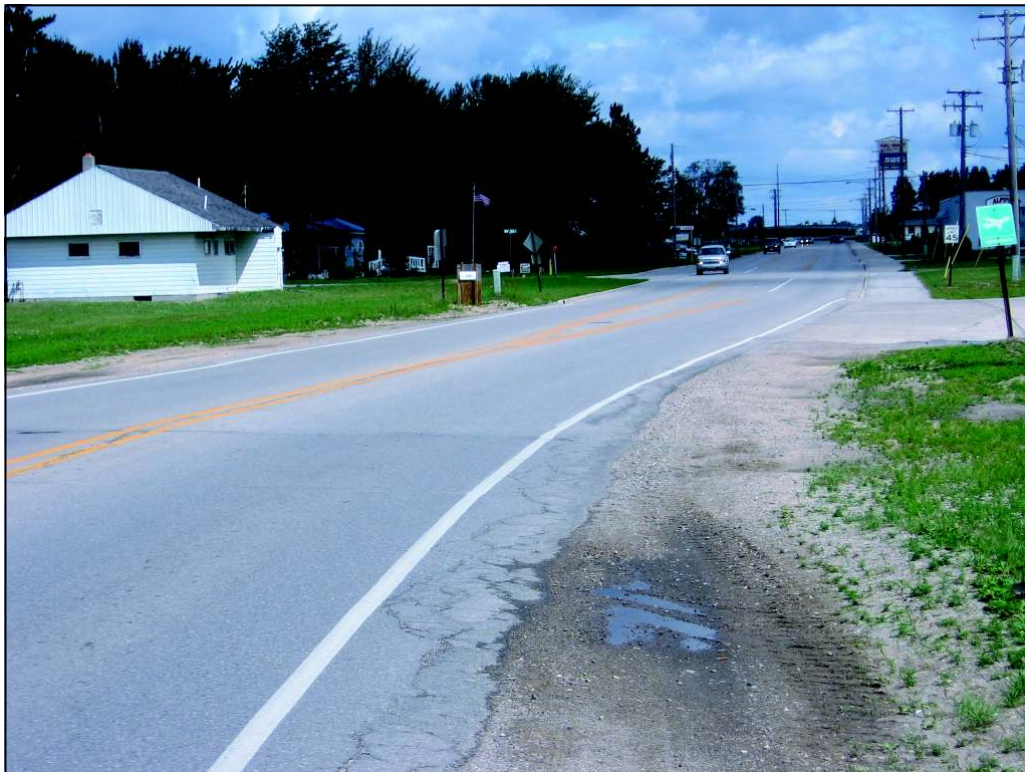
View of Dickerson Road looking north to the intersection with Van Tyle Road and the end of the project area.