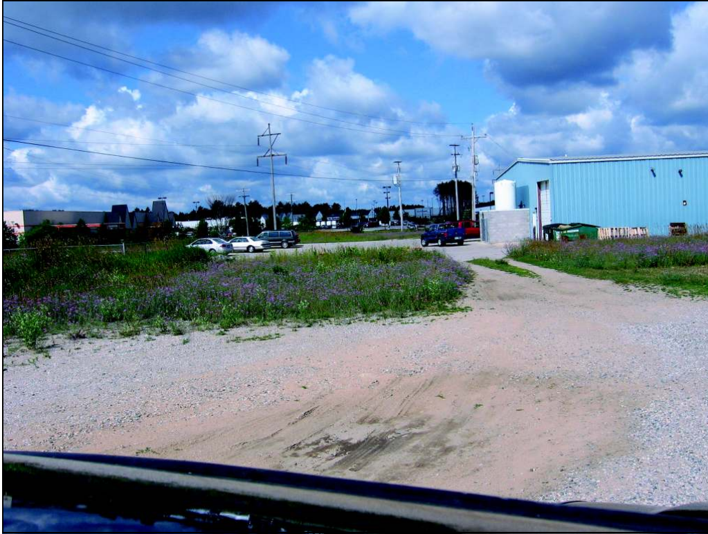
View looking west along the backs of buildings and the area where the proposed Mankowski Road extension will go. The two track road in foreground is a result of people cutting through to Home Depot.