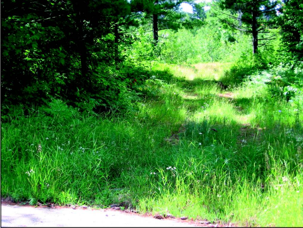
View looking south from the existing end of McVannel Road.