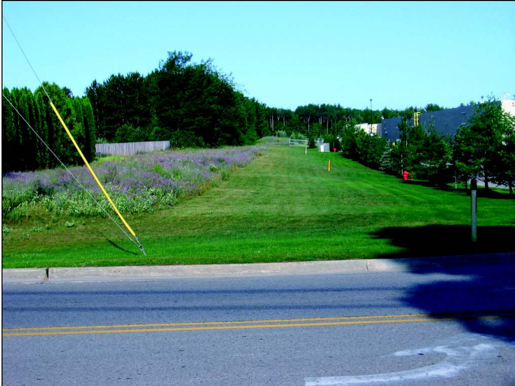
Closer view looking west from Dickerson Road along the existing ROW for the Edelweiss/Pine Ridge Service Road.