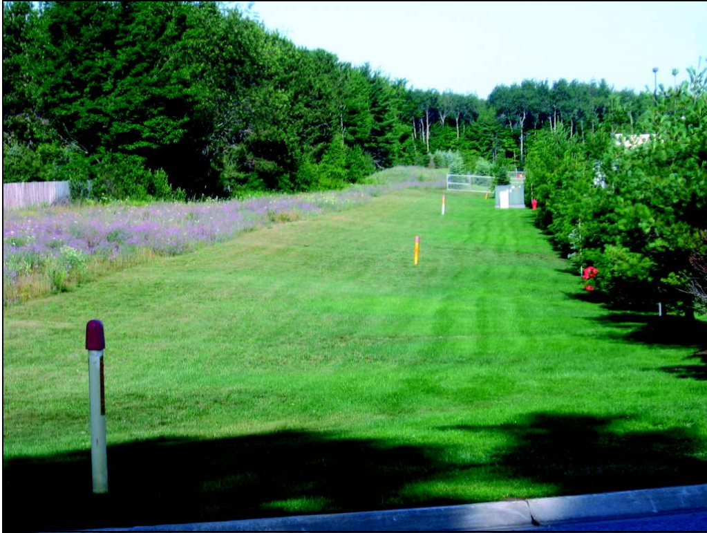
Closer view looking west from Dickerson Road along the existing ROW for the Edelweiss/Pine Ridge Service Road.