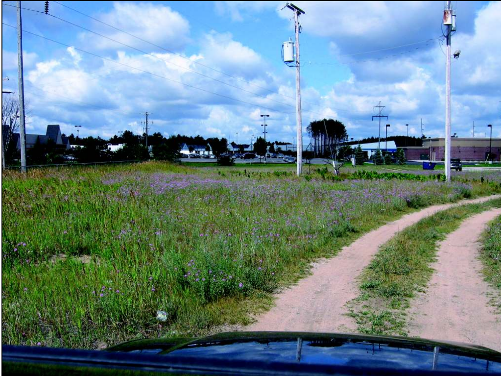
View looking west towards the Home Depot Parking Lot. The MDOT retention basin is on the left of the photo.