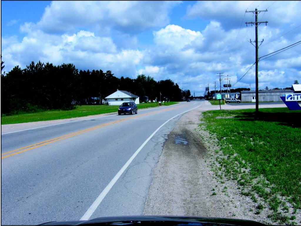
View of Dickerson Road looking north from the north end of the curve.