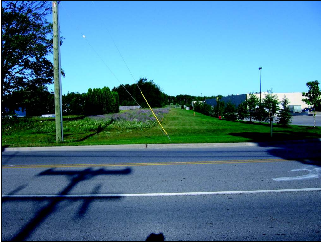
View looking west from Dickerson Road along the existing ROW for the Edelweiss/Pine Ridge Service Road. WalMart is on the right.