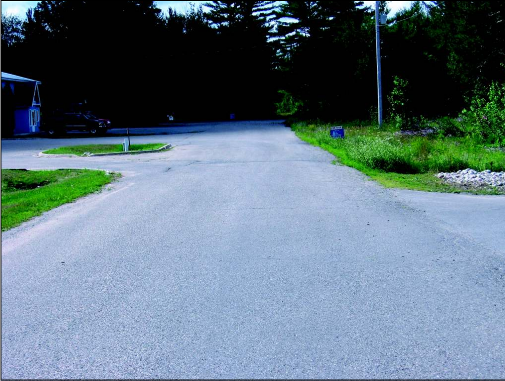
View looking south on McVannel Road to beginning of project area.