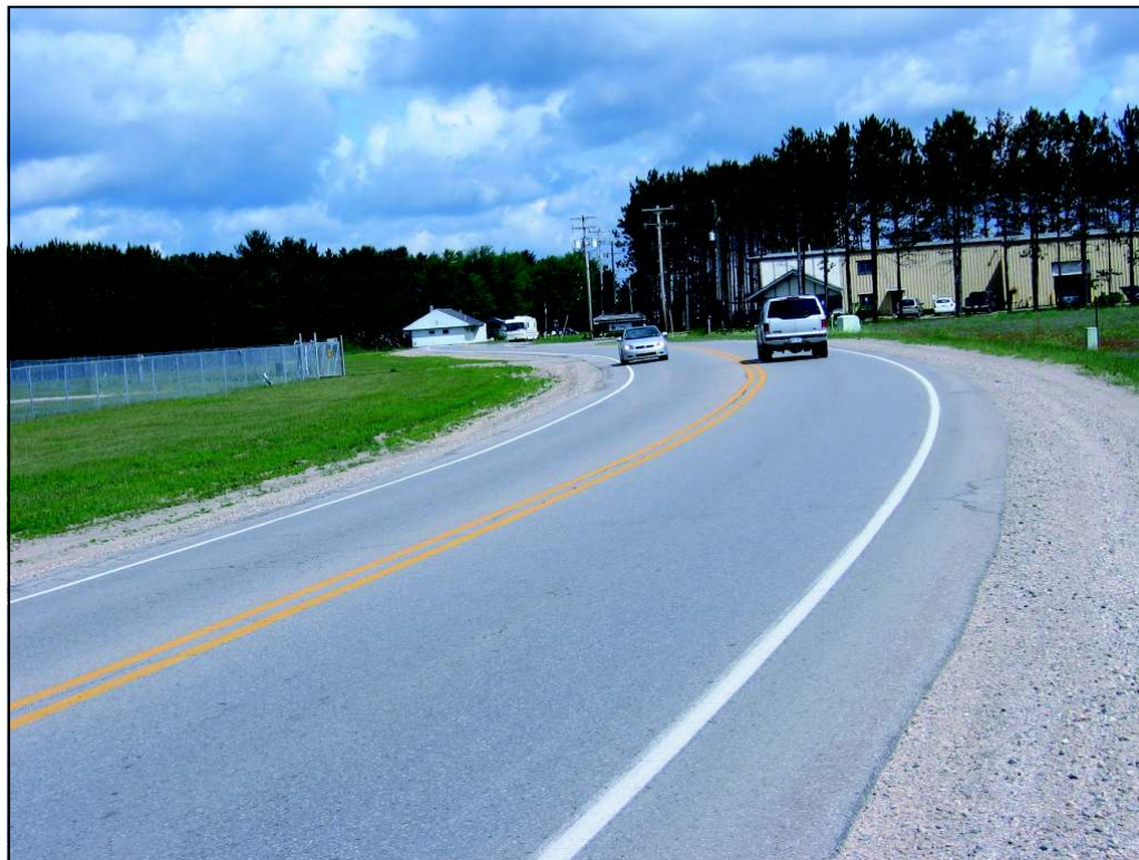
View of Dickerson Road looking northwest from the top of the curve.