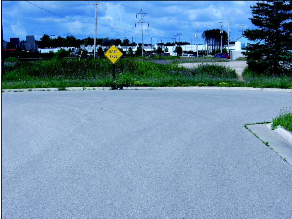
View looking west from the current cul-de-sac at the end of Mankowski Road and towards the Home Depot Parking Lot in the general direction of the proposed road extension