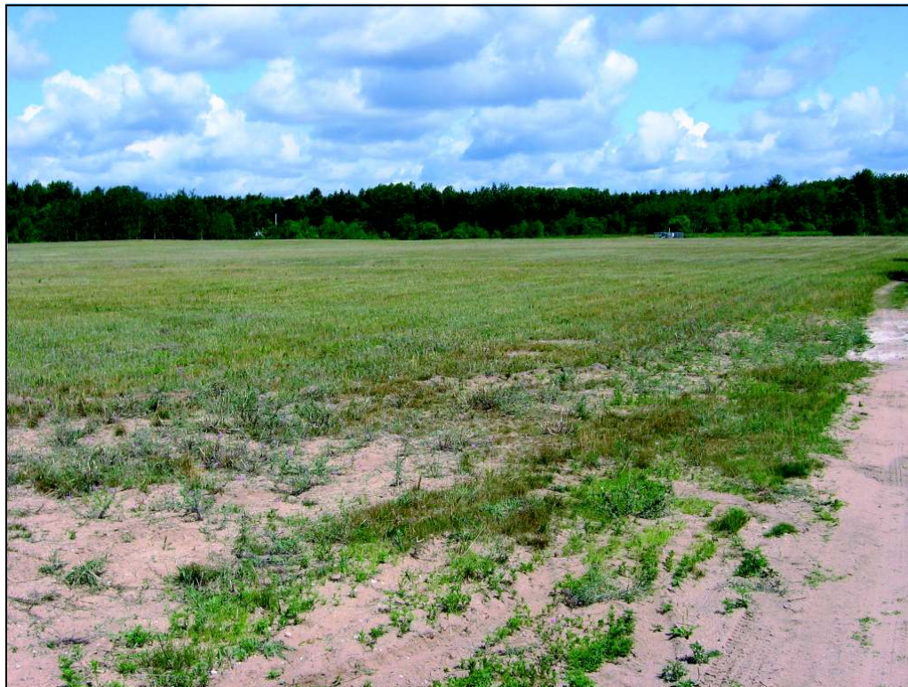
View looking northwest from Van Tyle Road toward from the point where the McVannel Extension will connect to Van Tyle.