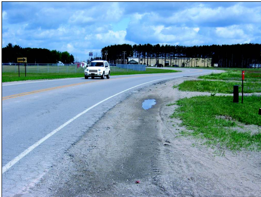
View of Dickerson Road looking north at the start of the curve at the east end of the runway.