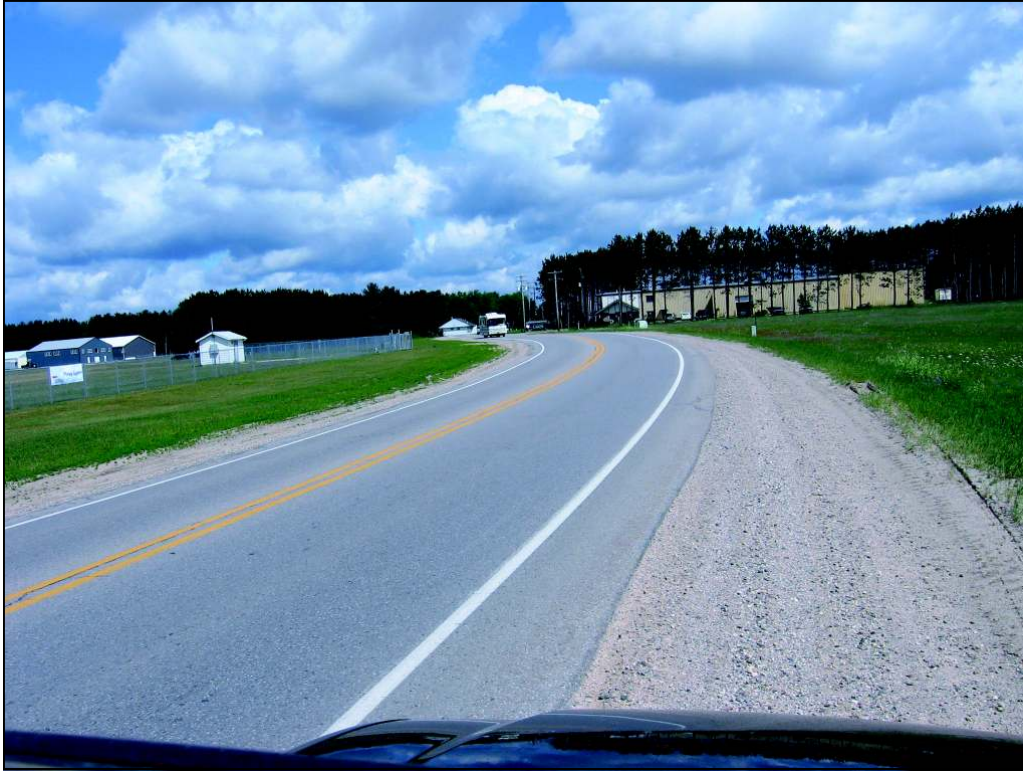
View of Dickerson Road looking north from the curve