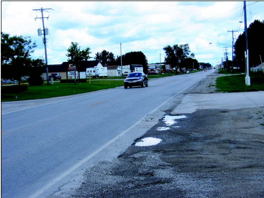
View of Dickerson Road looking north just north of the Milbocker Road intersection