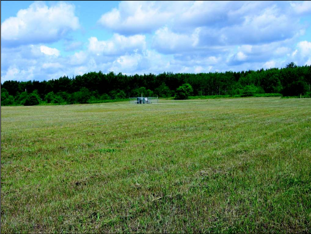
View looking northwest in the area where the McVannel Extension will be located.