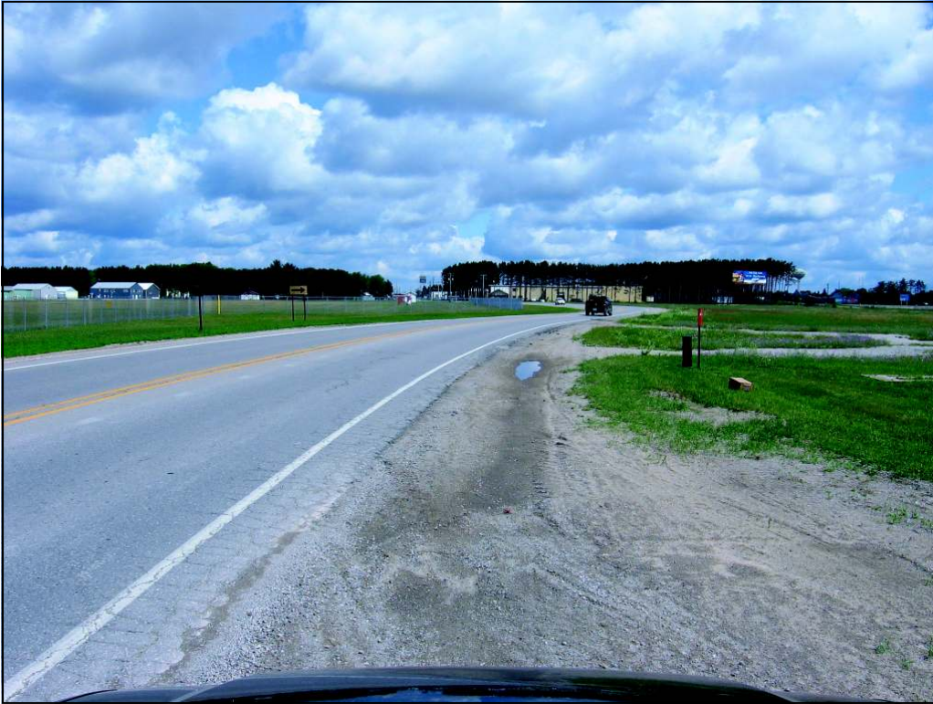
View of Dickerson Road looking north towards the curve at the east end of the East-West runway.