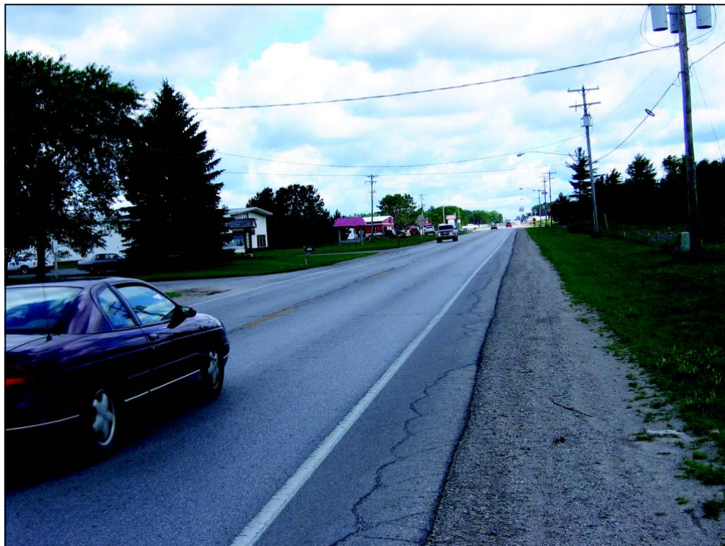
View of Dickerson Road looking north.