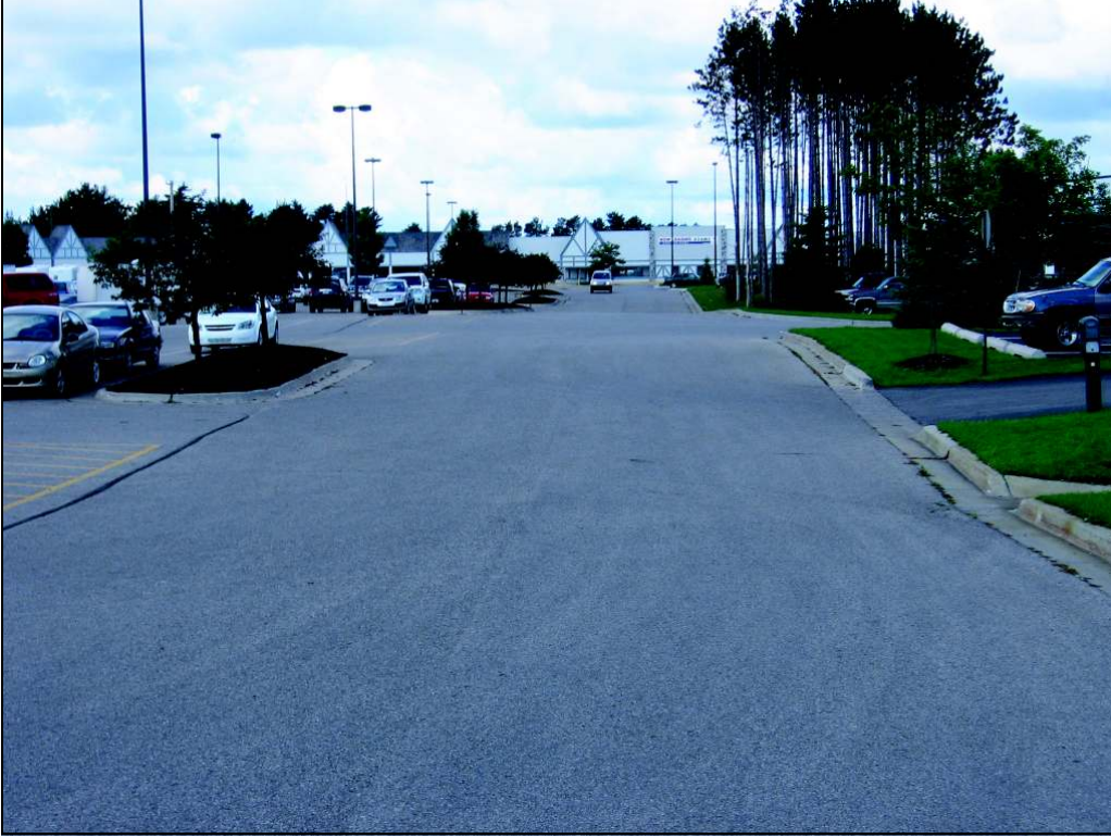
View looking west from the southeast corner of the Home Depot Parking Lot showing the internal access roadway that the Mankowski Road extension will line up on.