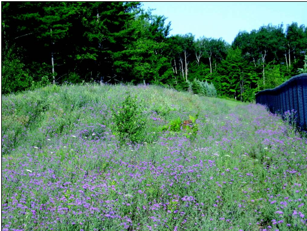
View looking west from about halfway along the existing ROW for the Edelweiss/Pine Ridge Service Road.