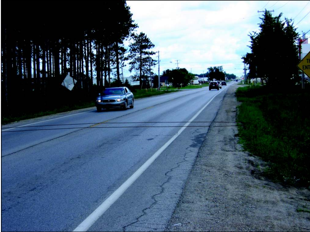
View of Project Area looking north towards the intersection with Milbocker Road and the start of the project area