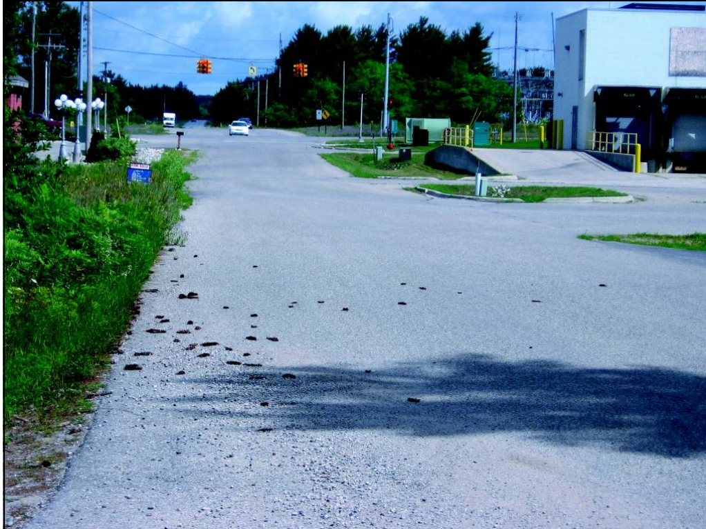
View looking north on McVannel from beginning of project area back to the M-32 intersection