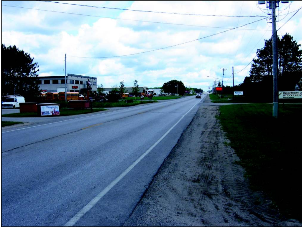
View of Dickerson Road looking north