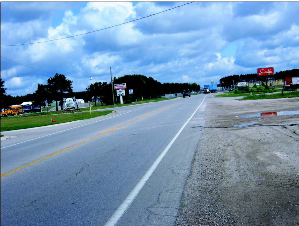
View of Dickerson Road looking north towards the entrance to the Gaylord Air Industrial Park (O'Rourke Blvd.)