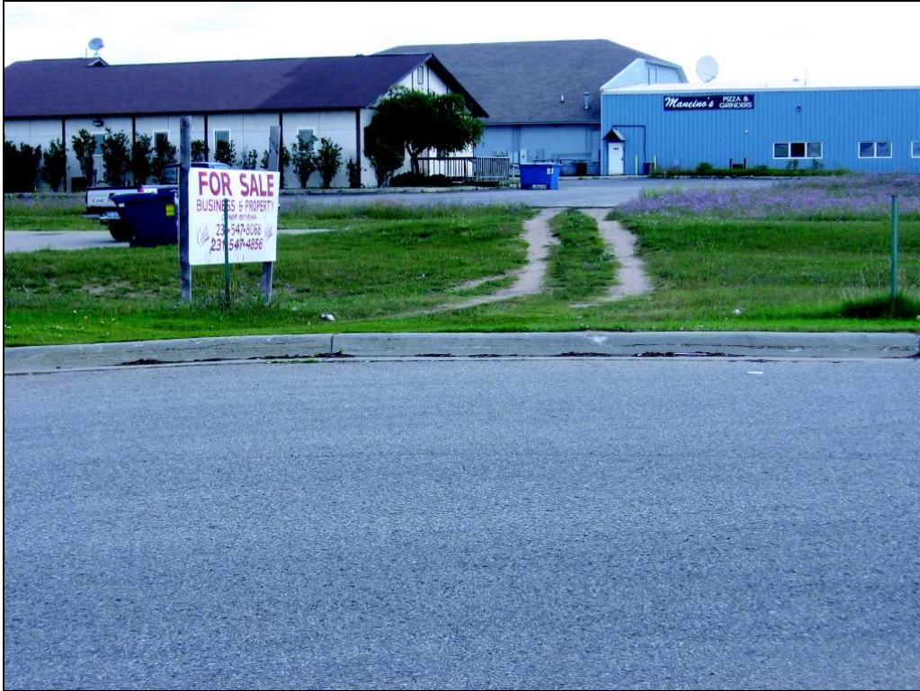
View looking slightly south east from the southeast corner of the Home Depot Parking Lot along the two track road created by people cutting between Mankowski and Home Depot.