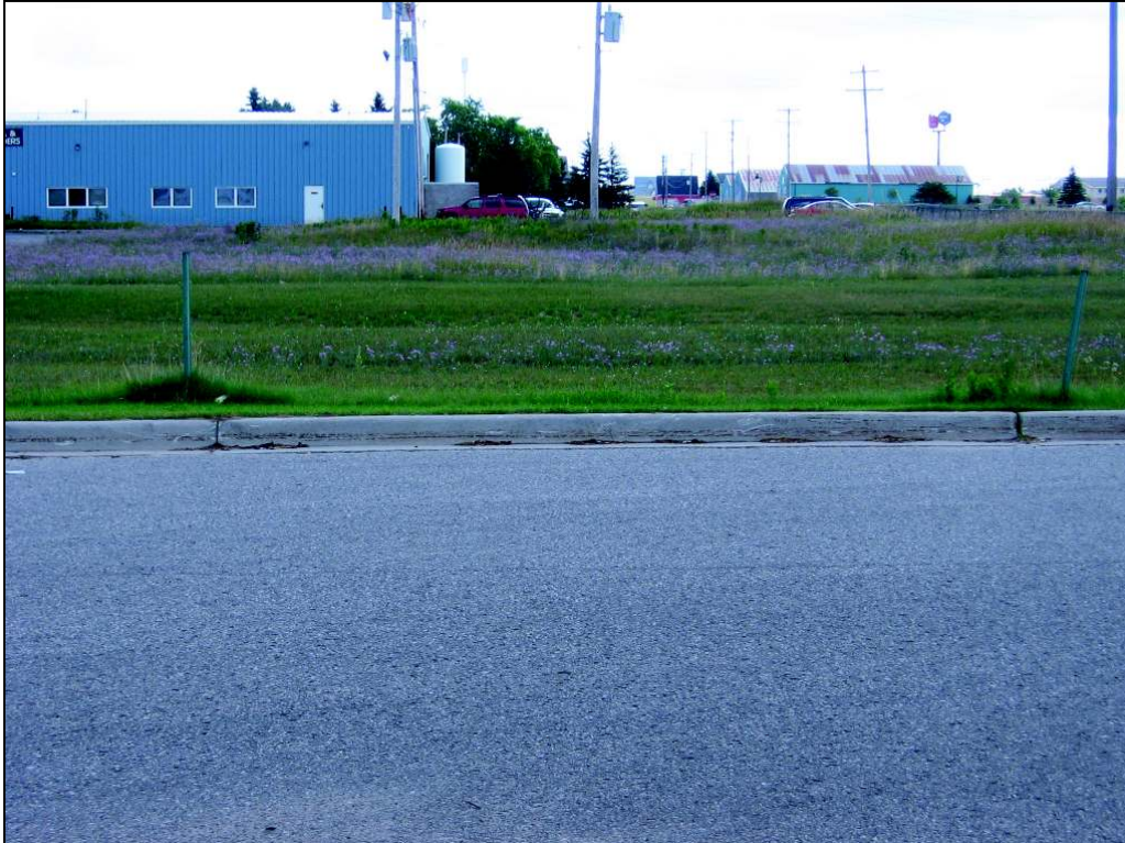
View looking east from the Home Depot Parking Lot toward the end of Mankowski Road.