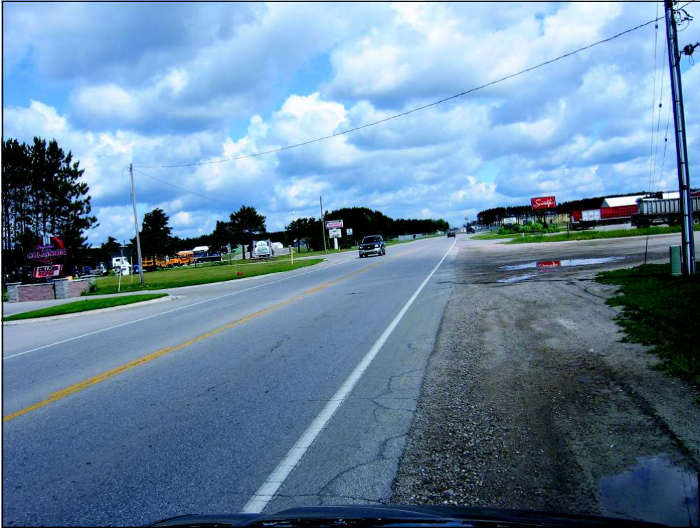
View of Dickerson Road looking north.