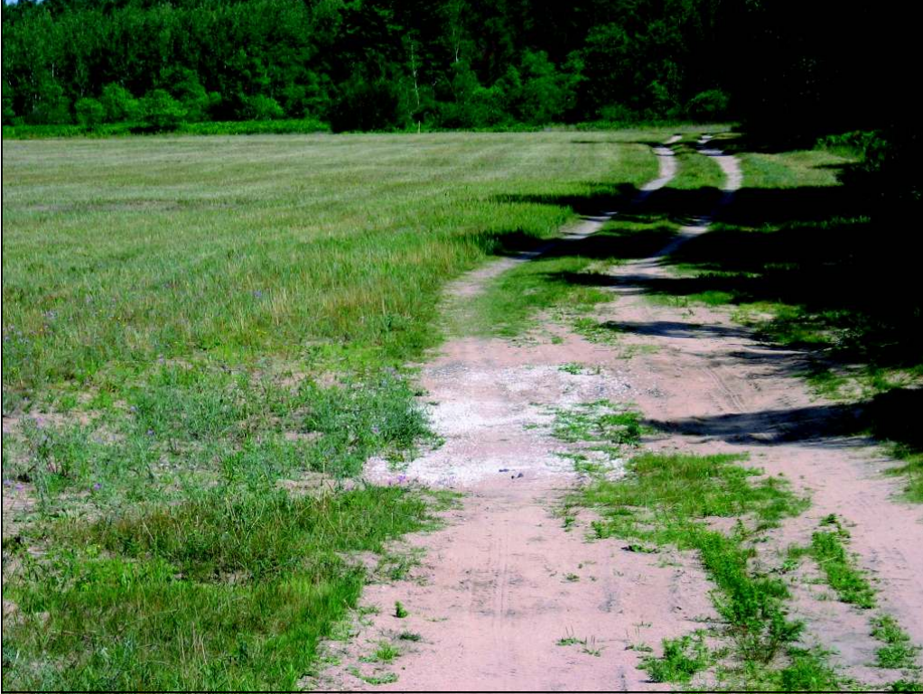
View looking north, north of Van Tyle towards area where the McVannel Extension will be located.