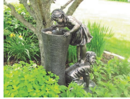
A view from our Garden Walk!