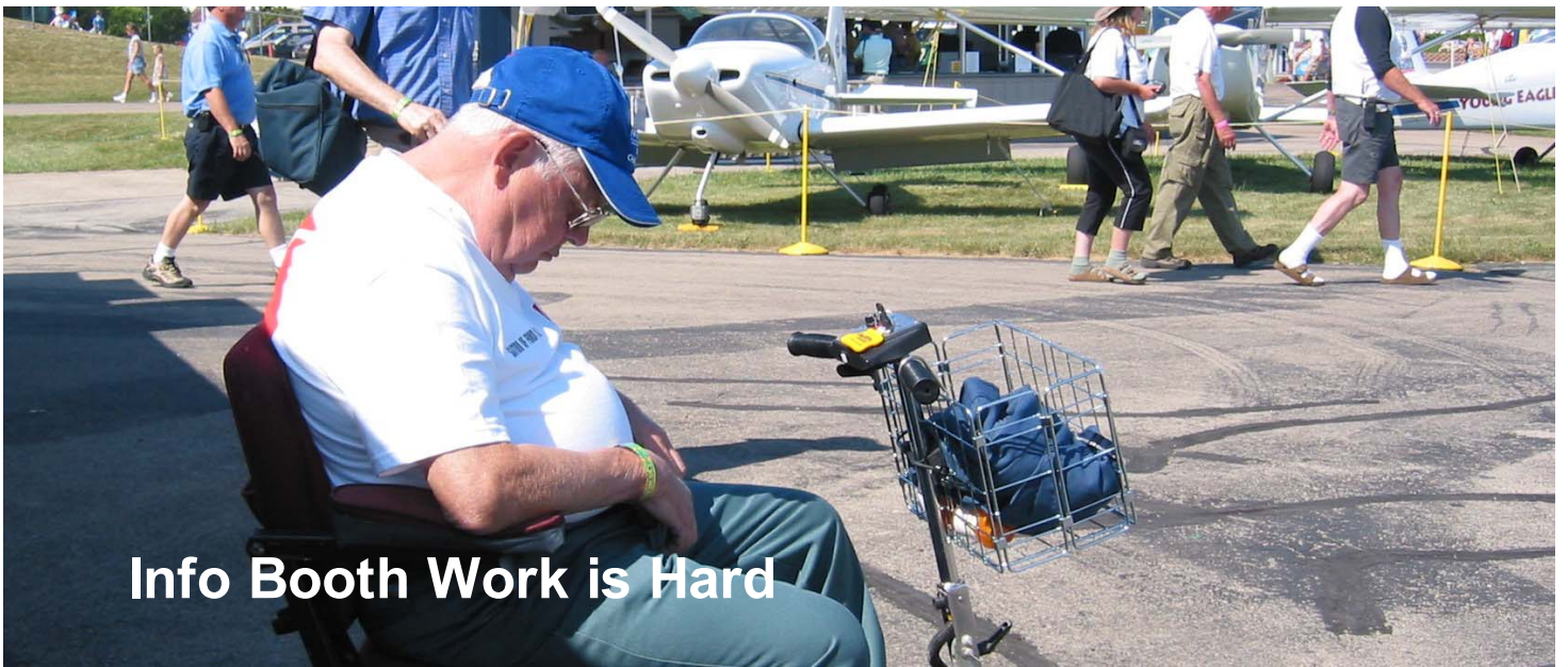
Info Booth Work is Hard