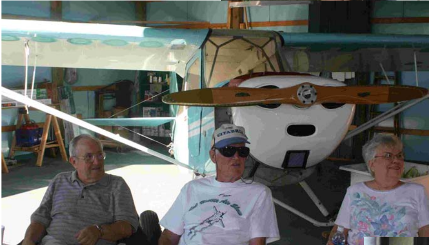
← Waiting for the corn