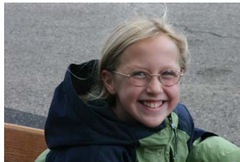
Why We Fly Young Eagles

On September 9 we joined 1087 flying out of the Boyne Falls Airport. The photo below is the best reason we take the time to fly Young Eagles. This smile is the best thank you that we will ever get.