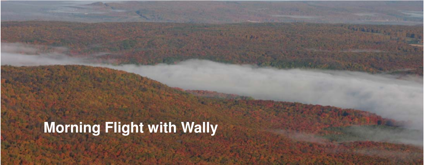
Morning Flight with Wally