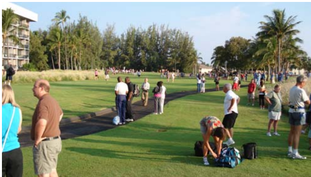
Crowd Outside After the Earthquake

We arrived one day late and then lost another day due to the earthquakes. In the future we probably will be a lot more concerned about leaving on a Friday the Thirteenth.