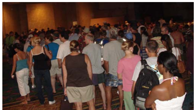
Emergency Food Line at the Hotel