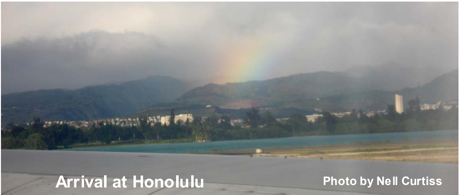
Arrival at Honolulu