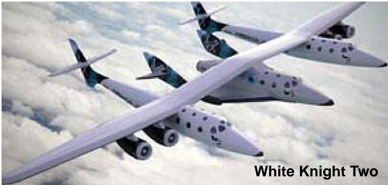
White Knight Two