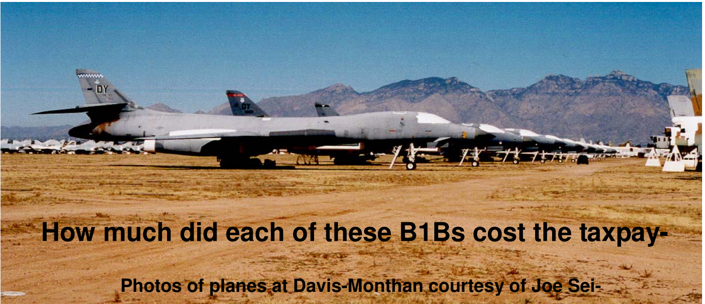
How much did each of these B1Bs cost the taxpay-