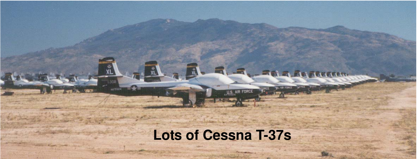
Lots of Cessna T-37s