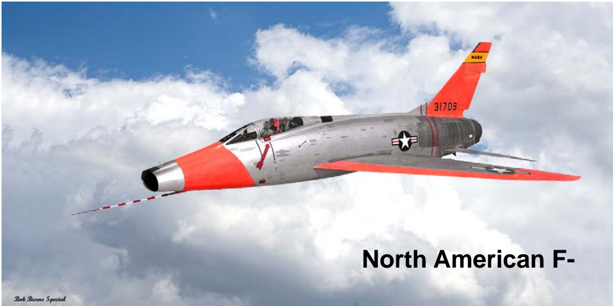
North American F-