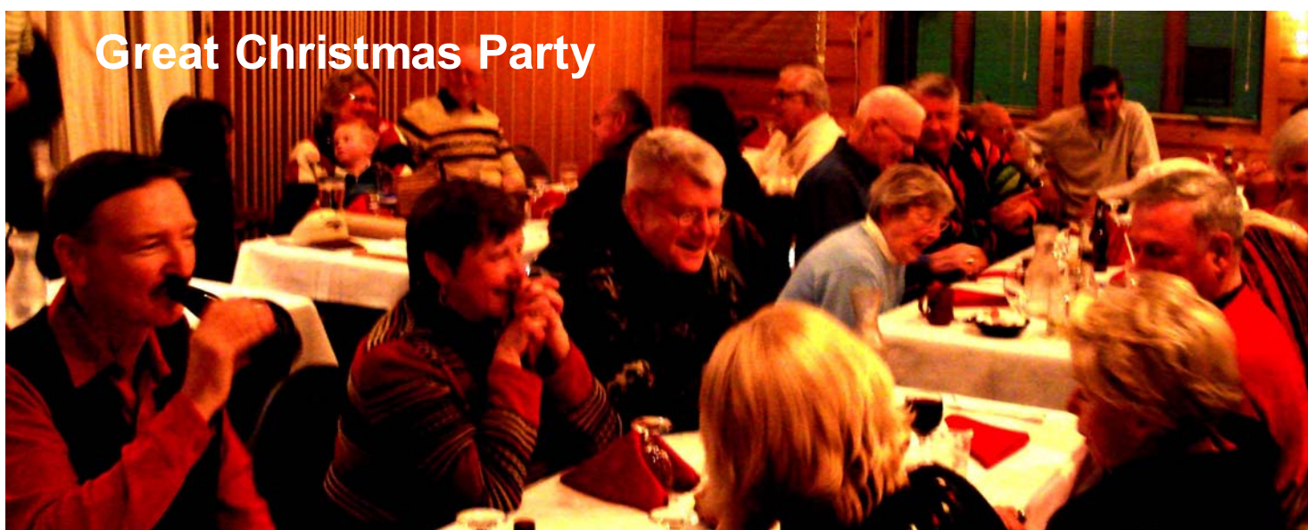
Great Christmas Party

EAA Chapter 1095 Newsletter Office Post Office Box 2223