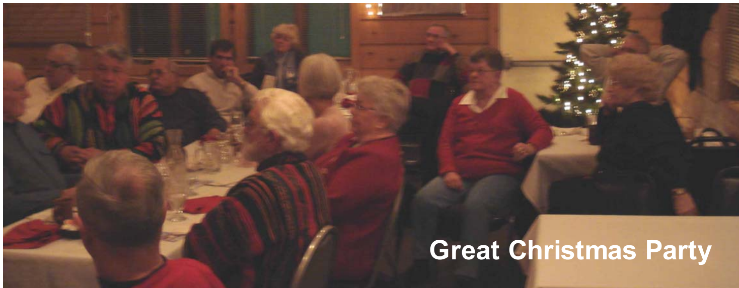
Great Christmas Party