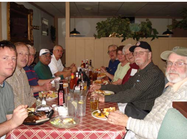
Lansing Tower Visit, May 20, 2006