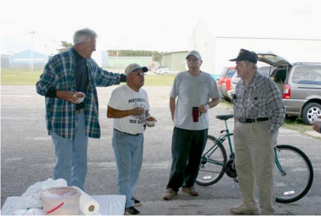
Pancake Breakfast June 26, 2005