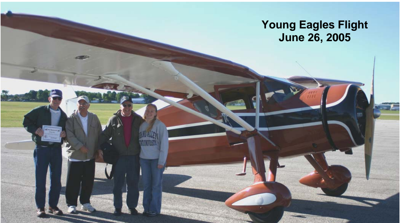
Young Eagles Flight June 26, 2005