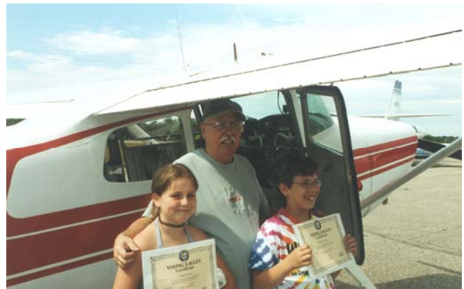
Young Eagles, Grayling June 9, 2001