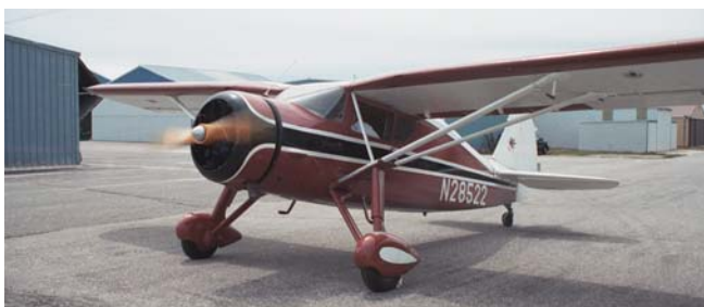
Where's our pilot? We miss him!