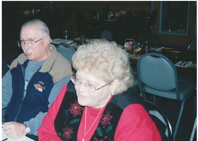
Christmas Party December 6, 2000