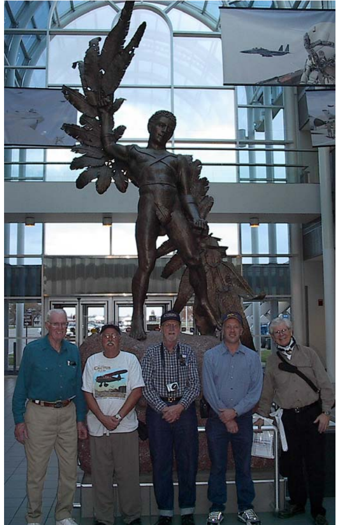
Air Force Museum, November 2005