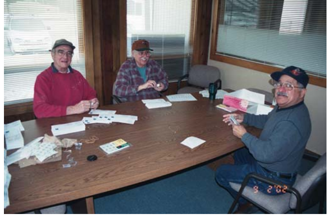
Mailing Work September 2, 2002