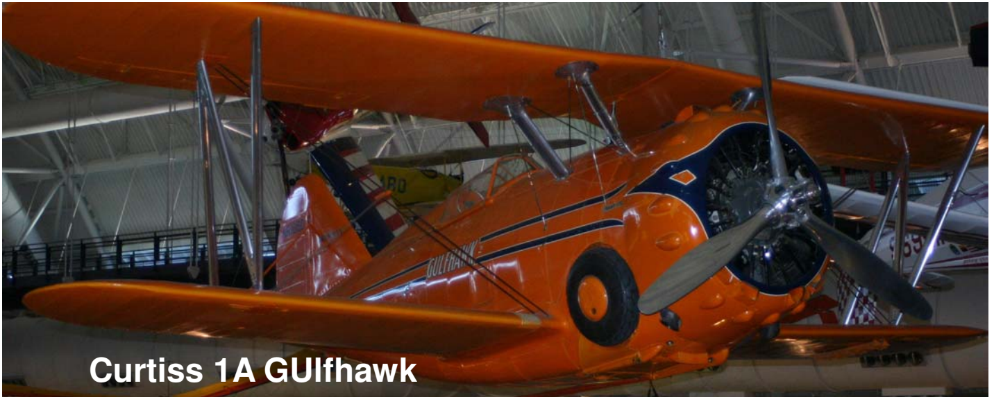
Curtiss 1A Gulfhawk