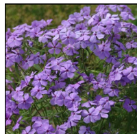
Wild Blue Phlox