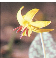
Yellow Trout Lily

Attract native bees and beneficial insects with native plants!