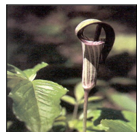
Jack in the Pulpit

Attract native bees and beneficial insects with native plants!